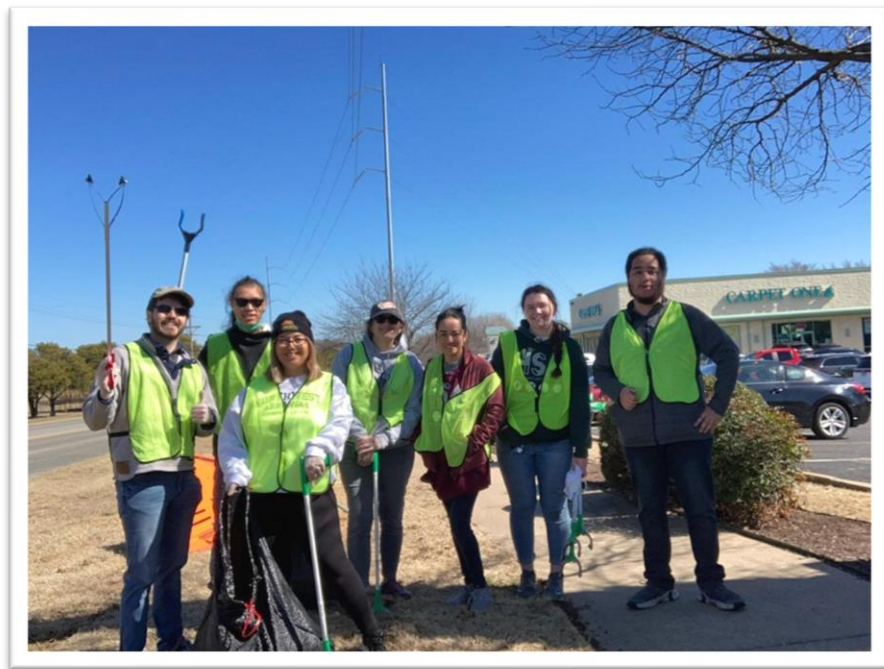
J Street Cleanup

My first time doing anything with the Honors Program was at one of the J Street garbage cleanups. Here I met many other honors students for the first time. As we picked up trash and became acquainted with each other, I learned more about the Honors Program and its members. They talked about the projects they were passionate about, all the things they did together as a group, and I began to learn