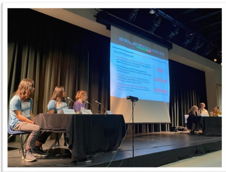
Food Insecurity Presentation

Being a part of the Honors Program made me change for the better as a person. I was able to make contributions to the NWACC community with honors projects. I learned from a diversity of honors students and educators that opened my mind to new ideas. I became curious and inspired to put ideas into action for something greater than myself. I made great friendships and found passion within the Honors Program. I learned to value community, curiosity, and diversity.