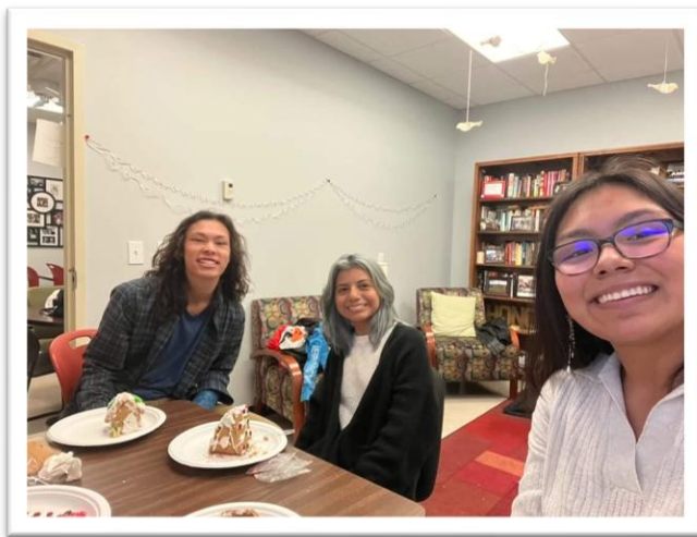
Holiday Hangout with Honors Program

Over the course of the next two semesters, I became more involved with the Honors Program and at NWACC. I made lifelong friends with the other Honors Program members and grew as a student and person because of them. I joined the Honors Student Association and became vice president and then the president. NWACC became more than just classes and grades, it became a place where I could make a change in the world by doing projects with the people I liked.