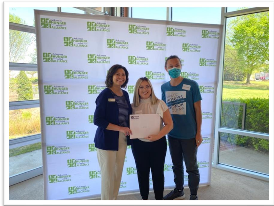
Receiving $1000 at Arkansas Hunger Summit