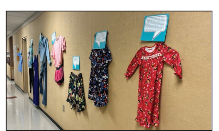
Sexual Assault Awareness Month

Awareness month opens up conversations about resources and voices in the community.