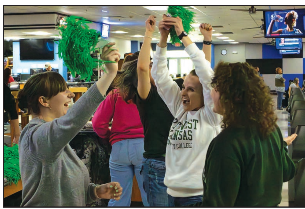
The librarians celebrate their wins; they later won the most spirited award for showcasing their team