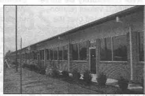
NWACC-Wash. Co. Center White & Elm Springs Road

ARHS 1003 Art Appreciation 21781 Art Appreciation